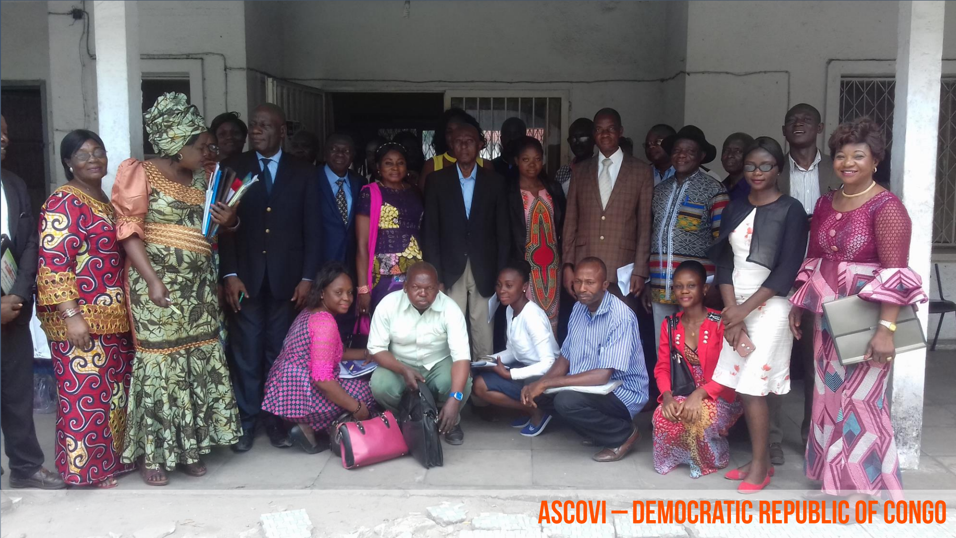
ASCOVI — DEMOCRATIC REPUBLIC OF CONGO